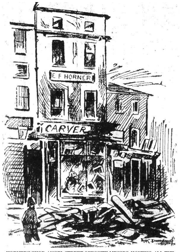
HORNER'S SHOP, ANGEL STREET OPPOSITE MESSRS. HOVEY'S. ALL THE FLOORS BURNT OUT. NOTHING REMAINING BUT WALLS.

Reaching across the roadway, the flames licked the side of the shops extending from Bank street corner to the Angel Hotel, and in the case of premises occupied by Mr. E. F. Horner caused great damage. The roof of Mr. Horner's establishment ignited first, the flames then extending downwards into the upper storey. This room was used for mounting pictures and general decorative work, and contained many valuable engravings and water colours. From there the fire continued descend until it reached the ground floor, destroying everything in its progress. The window was shattered, the contents destroyed, the outside ornaments and signs burnt away, and the structure gutted, fire and water together making a complete wreck of the whole place. Fortunately the fire did not extend in the direction of the rear, the stables and the outbuildings were saved and the horse removed unharmed. But things were quite bad enough as they were; the damage to stock alone amounting to nearly £400. In the window was a valuable picture worth a hundred guineas. This was destroyed. Mr. Horner says he is insured, and thinks his loses will be met. In addition to the damage to stock there is the ruin of the shop, this latter being no inconsiderable item, the place being totally unfitted for anything, and in need of entire reconstruction.